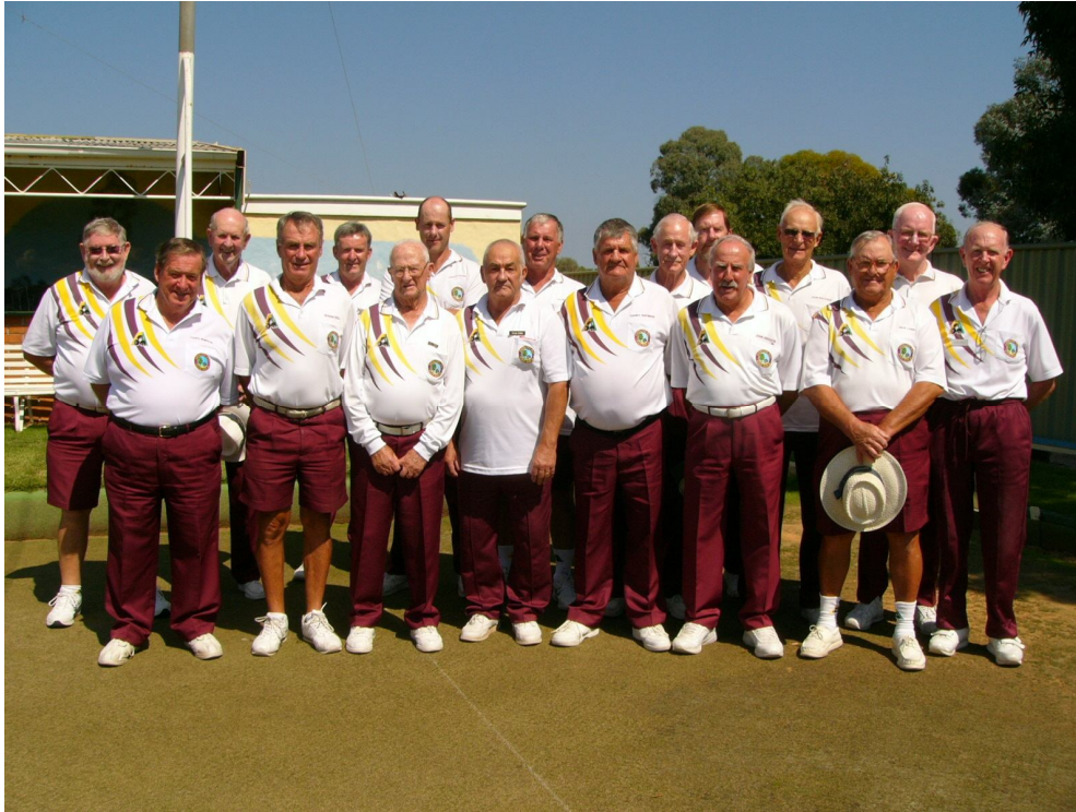
GVBA DIVISION 3 PREMIERS 2010-11

Three premierships in a row is a mighty effort! They achieved this with great bowling in the grand final at Murchison defeating East Shepparton. The Club is very proud of this Division's winning streak. The wonderful support the other members of the club gave them throughout the final series was greatly appreciated. Let's aim for 4 premierships in a row!